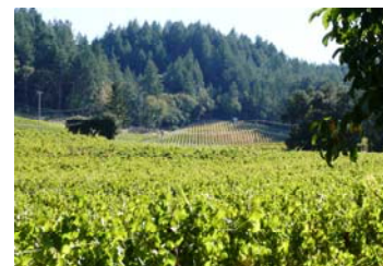
LaTour Vineyards Perched at the top of Mt Veeder

Our next event will be a tasting at Copia on September 13th. Come join us!