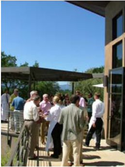
Club members enjoying our 2006 Harvest Party at our home.

“Wine to me is passion. It’s family and friends. It’s warmth of heart and generosity of spirit. ... I know that wine is, above all else, a blessing, a gift of nature, a joy as pure and elemental as the soil and vines and sunshine from which it springs.”