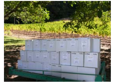
There’s always lots of wine for you to take home.

empty trunk so you can stock up on our great Harvest Party wine specials. As our club has grown, we unfortunately need to limit the number of guests, so look for your invitation and sign up early to save your place. As in prior years, this is an event you won’t want to miss!