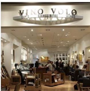
Vino Volo in Seattle is the perfect place to relax when waiting for your plane.

It’s too early to have the final results of this year’s event, but the Auction has given nearly $78 million to the Napa Valley community over its 27 year history. In 2007 the Napa Valley Vintners pledged $2.4 million for “strategic community initiatives” over and above the $6.4 million given in grants to local non-profits.